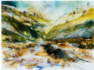
Gordale Scar – Malhamdole, Yorkshire Dales, mixed media and PanPastels on Canson Moulin du Roy Not 140lb (300gsm), 22×30in (56×76cm). Mixed-media painting in progress before adding PanPastel (above) and after adding PanPastel (below). This studio painting is based on an outdoor sketch made with different media. To maintain the spontaneity, freshness and expressive feeling, I kept my marks open and loose. Having applied several layers of acrylic ink and gouache wash I applied PanPastel bright yellow-green shade (880.3) with the large sponge Soft Tools as I would a brush. This one colour made all the difference – imagine what other colours are going to do!

With PanPastel colours and Soft Tools you can create very painterly visual effects and finishes, not only in pure pastel works but within mixed-media paintings, too. It's well worth giving them a try.