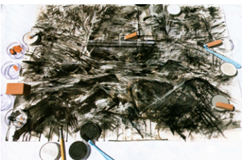
4 Flowing Waters – Rydal Beck, Rydal Hall, Cumbria, mixed media with PanPastel on Canson Moulin du Roy Not 100% cotton watercolour paper 140lb (300gsm), 21×27in (53.5×68.5cm).

I used inks, black and white gouache and black acrylic paint as washes, charcoal and black pastel to create the foundation for the rest of the painting. It provides the perfect foundation for mixes of PanPastel pearl medium black fine, pearl medium black coarse, pearl medium white fine, pearl medium white coarse, black 800.5, neutral grey extra dark 820.1, neutral grey extra dark 820.2, neutral grey shade 820.3 and titanium white. I used a wide variety of Soft Tools to create the marks – the possibilities for creative expression are endless