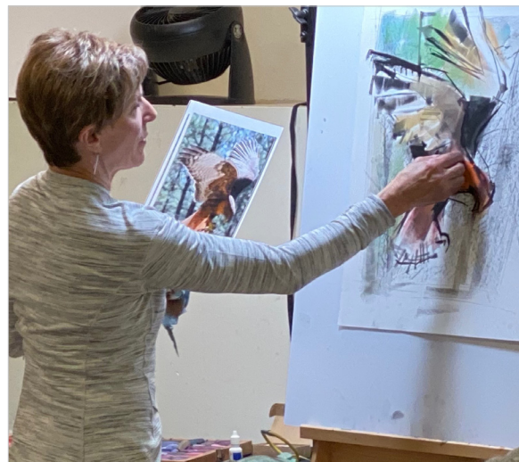
ONLINE VIDEO OF DAWN DEMONSTRATING WITH PANPASTEL: YouTube.com/PanPastel

PanPastel Colors are non-toxic and less dusty than stick pastels. They are easy to store, transport, and clean. With this set of 40 pans and a few applicators you should be able to mix virtually any color you wish, including metallics, pearlescents, shades and tints! You can even "dilute" any color by adding the Colorless Blender to it. PanPastel Colors are fun to use and don't require an easel or special "pastel" papers. Enjoy creating and combining colors as you would with paint. The color mixing chart enclosed is only to give you an idea of where to begin! Just play and discover what you can do!"